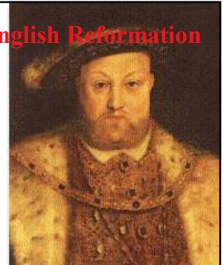
a portrait of Henry VIII