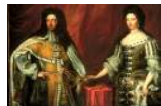
William and Mary