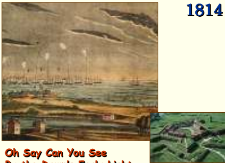
Oh Say Can You See By the Dawn's Early Light... -- Francis Scott Key