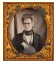
John C. Calhoun [SC]